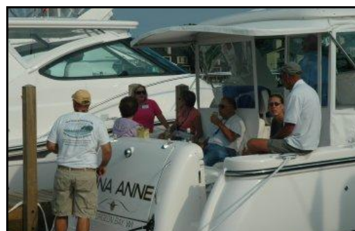
Below: Tiara 3600 Sovran at the 2008 Tiara Rendezvous, Charlevoix, MI